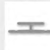
XFB-0000 One Piece Flat Division Bar

For additional information on FRL Wall Protection Panels, please contact your Nevamar sales representative or local distributor.