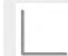
XCF-000 Outside Corner Flat

Installations can be completed with easy-to-use seam treatments. Available in aluminum and several color coordinated PVC moldings. Color matched silicone caulking is also available. Moldings are sold in 10' lengths. Molding profiles are not shown at actual size.