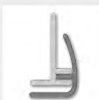
XCR-000 Outside Corner Round 2-piece kit