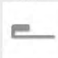
XSC-000 Standard End Cap