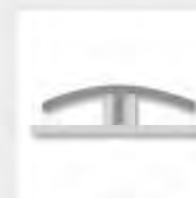
XDB-000 Division Bar 2-piece kit