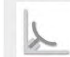
XIC-000 Inside Corner 2-piece kit